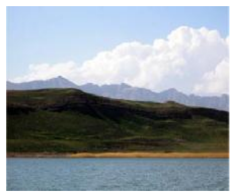
Figure 6- Vegetable covering of Kalat formation in prospection view of Mozduran formation