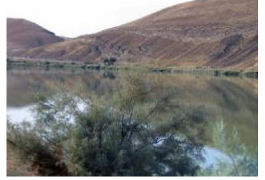
Figure 4b- The outcrop of kalat formation east of the lake