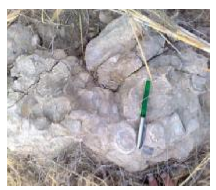
Figure 5- a sample of Hipporites