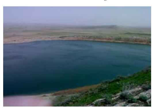
Figure 4a- The outcrop of pesteligh formation in in south of the lake