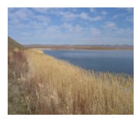
Figure 7a- verglades in the margin of the lake