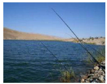
Figure 7b - Fishing in the lake