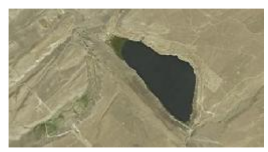
Figure 1- Sattelite image of lake